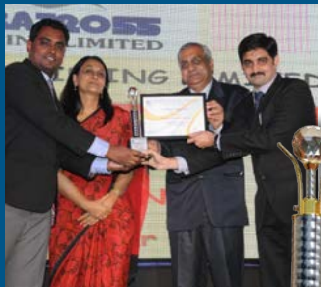
The Albatross Shipping, Ahmedabad team receiving the trophy and award

We are confident that with such recognition coming our way, under the Albatross umbrella, we will keep striving harder to achieve more success and glory.